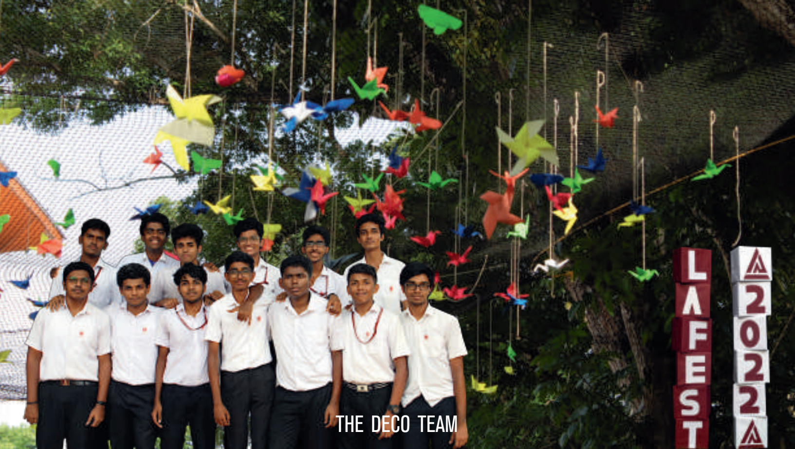
THE DECO TEAM